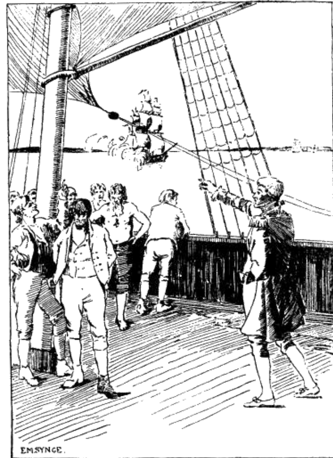
SHANNON AND CHESAPEAKE.

"She will surely be out to-day or to-morrow," he said, pointing over the gleaming waters. The hours passed on. Daylight was beginning to wane, when a cry rang out through the ship, "She is coming!"