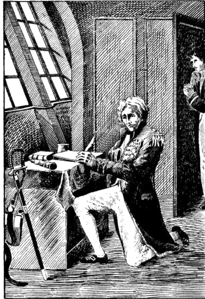
NELSON BEFORE TRAFALGAR.

the orders shining on his breast—all spoke of faithful service to his country. To-day he was to complete that faithful service, by the surrender of his life.