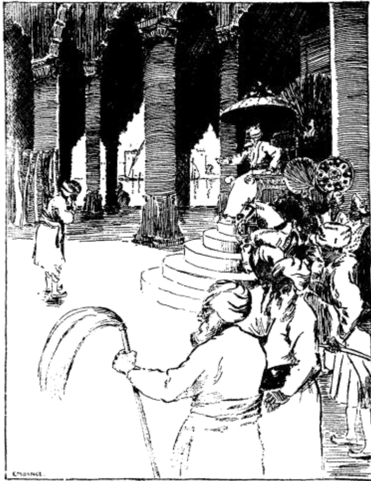
THE GREAT MOGUL.

bearing an inscription in gold: "If there be a Paradise on earth, it is this." The throne was in a recess at the back of the hall, and over the throne was a peacock made of gold and jewels, valued at a million pounds.