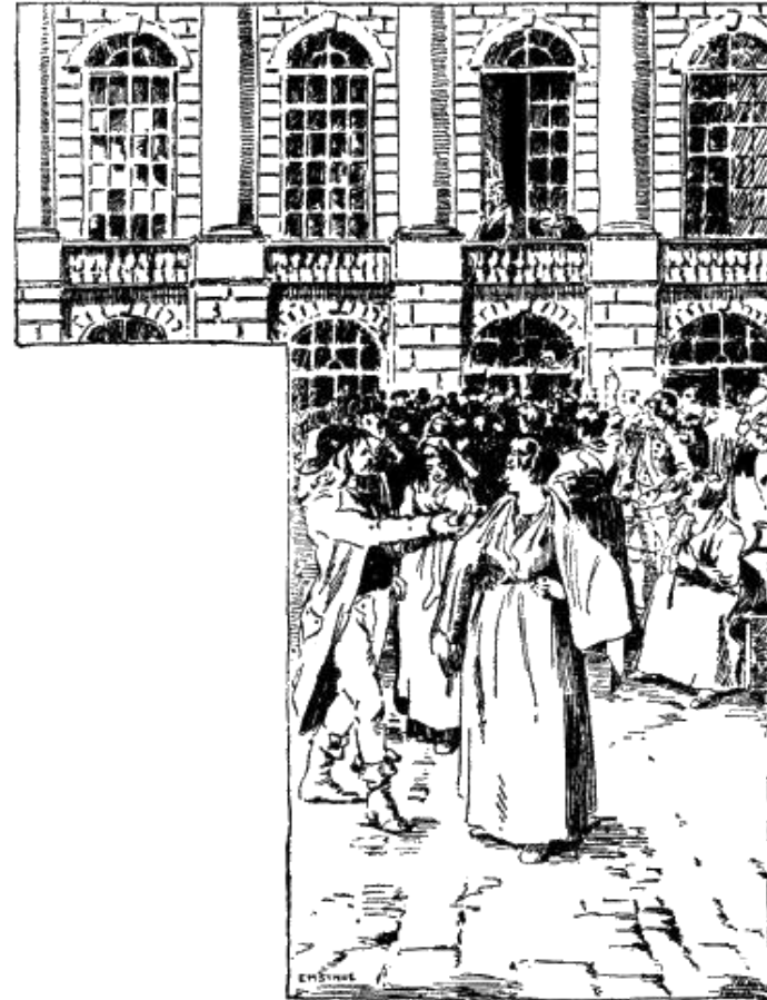
MARIE ANTOINETTE ON THE BALCONY AT VERSAILLES.

stepped forward and sought to make her peace with the people. He stooped before them and kissed her hand.