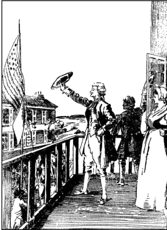
DECLARATION OF INDEPENDENCE.

own money. Mercy can do no harm: it will seat the king where he ought to be—throned in the hearts of his people."