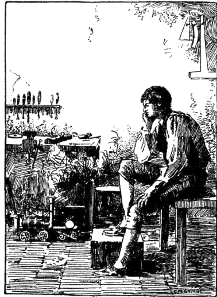
JAMES WATT AND THE STEAM-ENGINE

thirty-two hours—the first voyage of any considerable length made by a steamer. But she terrified those who saw her.